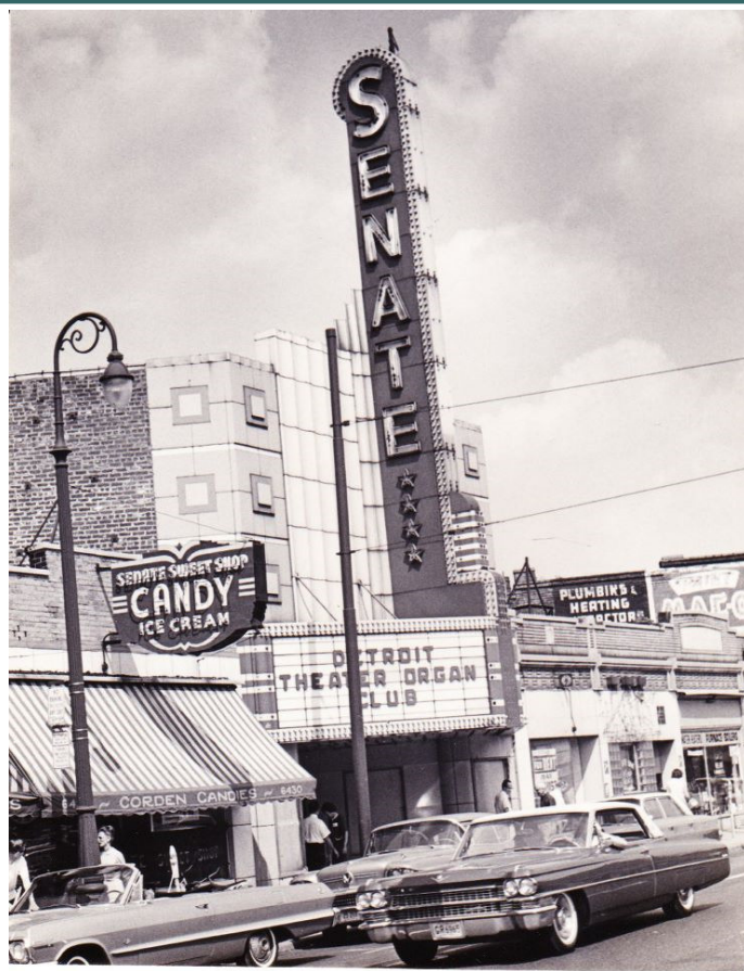
The front of the Senate Theater in a not-so-distant past