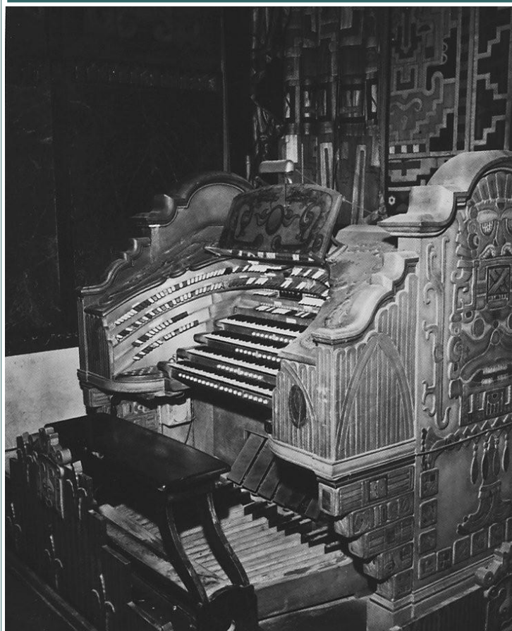
The Fisher organ in its original home at the Fisher Theater

Doors open one hour prior to all event times. Schedule subject to change. For the most up-to-date schedule information, visit our web site at www.dtos.org .