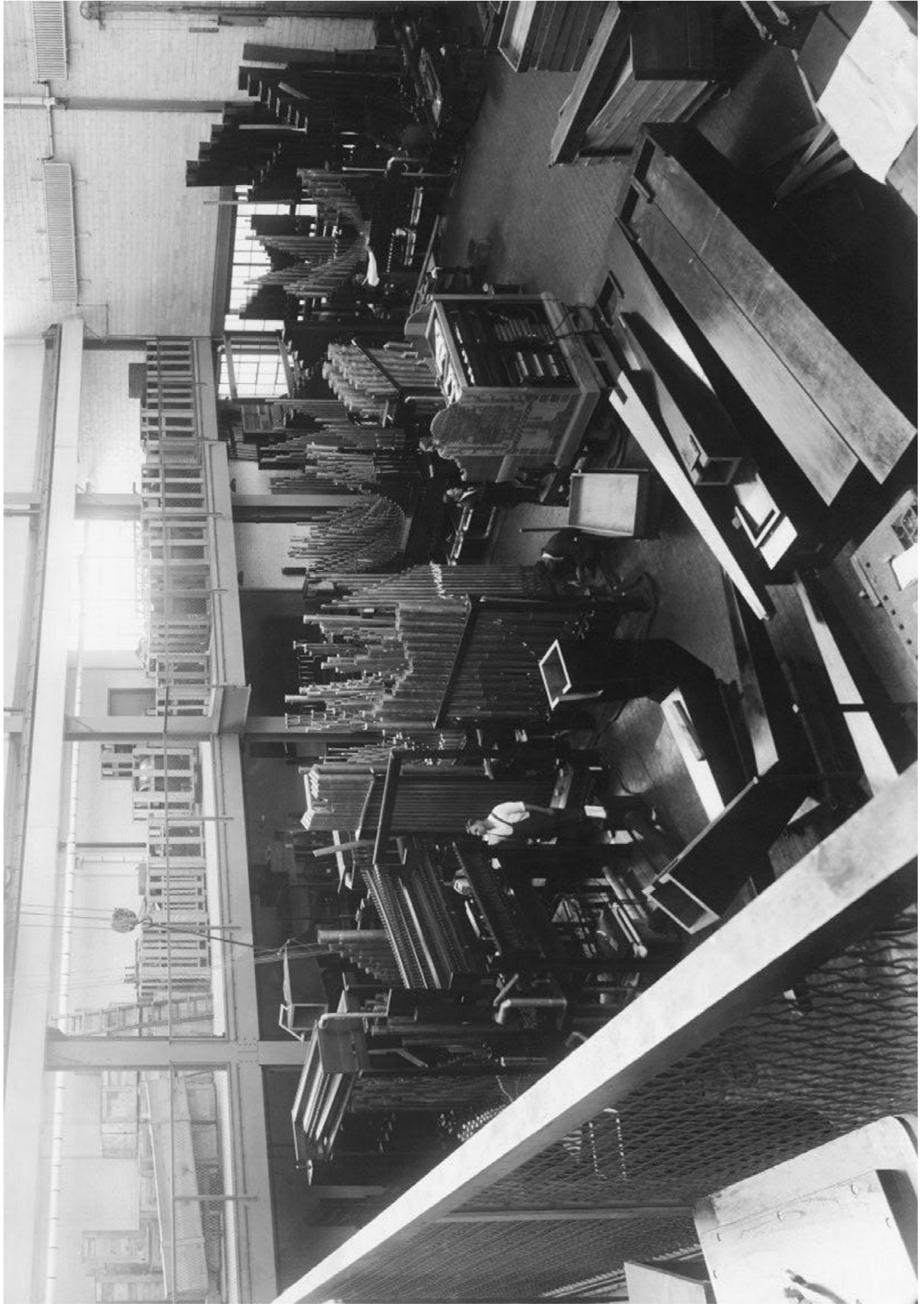
The Fisher Organ on the Wurlitzer Factory Floor in North Tonawanda, New York